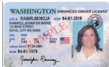
Enhanced Driver's License - Facial Recognition - RFID chip – used as a DL/ID-passport for border-states