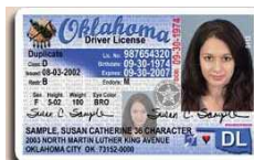
Driver's License with Facial Recognition Biometrics