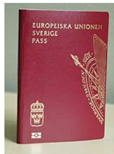
EU e-Passport with biometrics, RFID chip and ICAO biometric e-Passport Logo