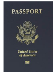
Tourist Regular Passport Cover